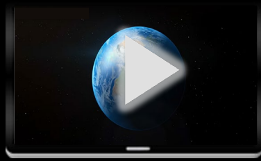
Novartis Gratitude Video