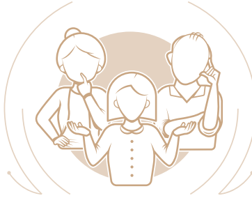
Hypothetical patient profiles.

*See the full Prescribing Information for ARIKAYCE for information about the limited population.